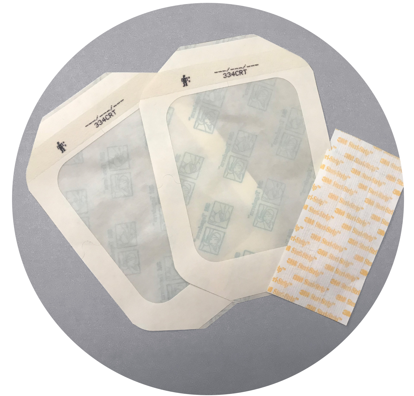
Dressings & Adhesive Bandages