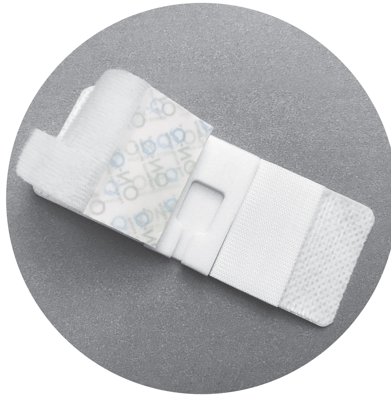
ON-Q* Catheter Securement Device